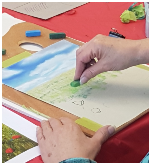
Soft pastel workshop, Feb. 17, 2024