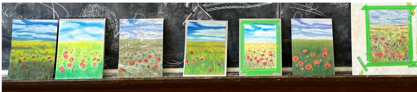
Soft pastel workshop.