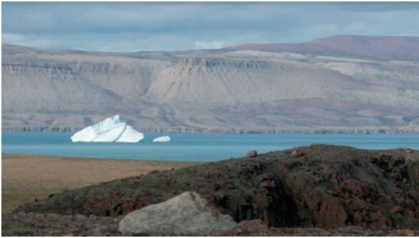
Cory Trépanier, screen-grab still image